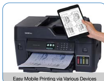
Easy Mobile Printing via Various Devices