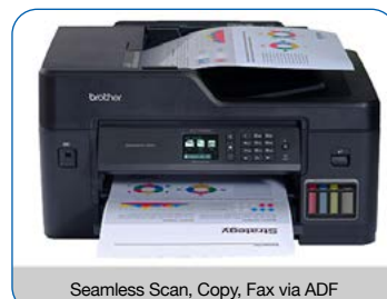
Seamless Scan, Copy, Fax via ADF