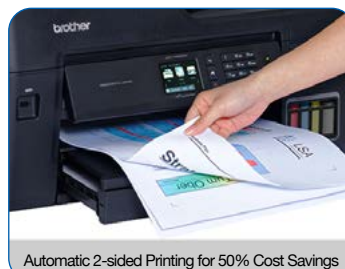
Automatic 2-sided Printing for 50% Cost Savings