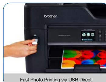
Fast Photo Printing via USB Direct